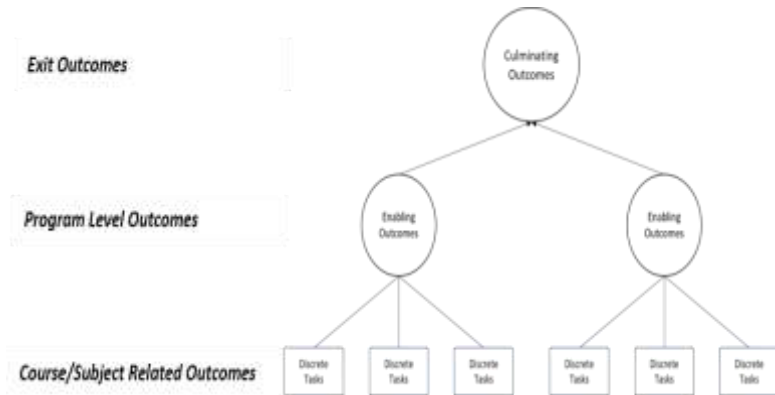
Figure 1. Levels of Outcomes of Education